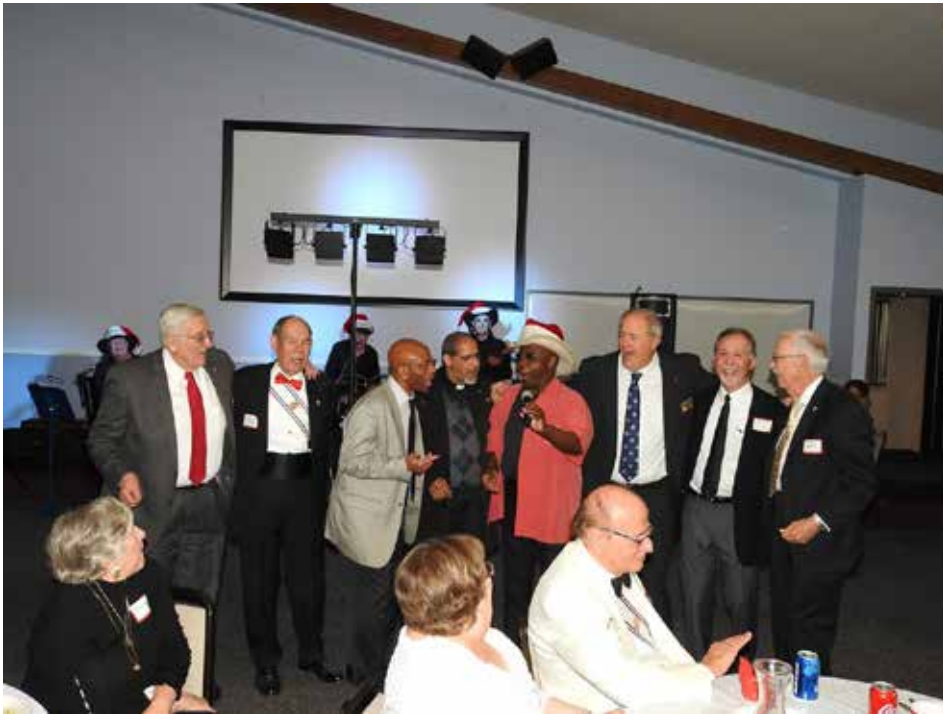
Assembly 2294 Christmas Party 2019 at the Risen Christ hall.